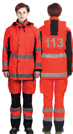
STATE EMERGENCY MEDICAL SERVICE WORKER