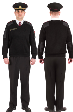
FIREFIGHTER AND INSPECTOR