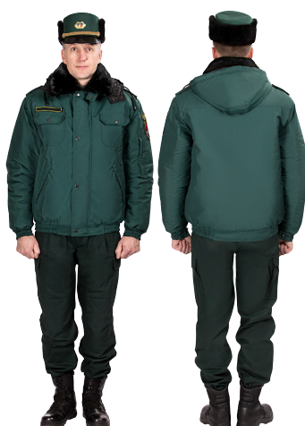
STATE BORDER GUARD